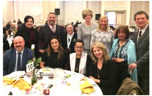
TCDSB present at Grand Cinnamon Banquet November 17, 2019

It is great to have them pray monthly with their friends. Our teachers cannot believe how well-behaved the majority of the stu-