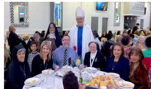
SMCDsb & TCDSB present at Julius Banquet October 27,

They help our students and staff explore their faith more fully and develop the special prayerful relationship with our Holy Mother. The Rosary Apostolate is always a welcome visit to our classrooms.