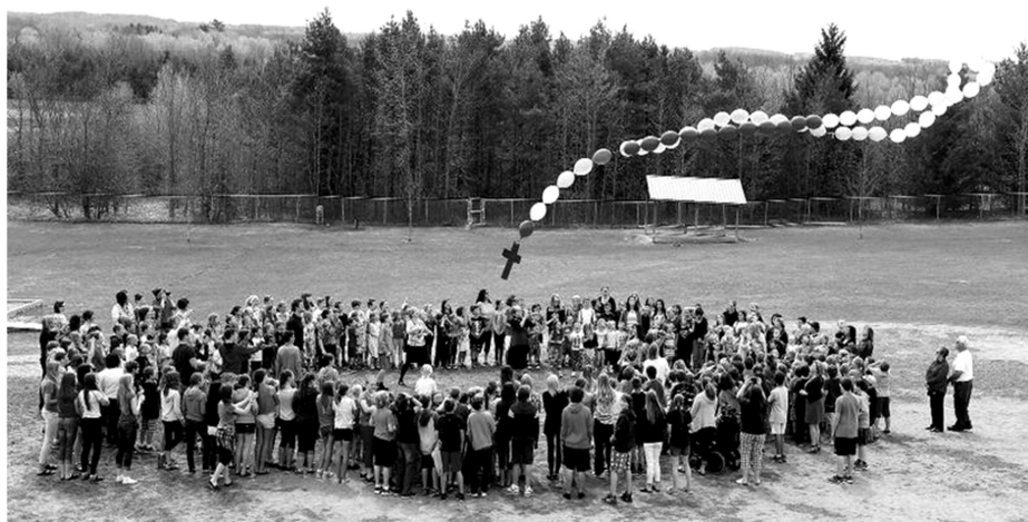
The Rosary Apostolate program at St. Martin CES in Ennismore following their May Celebration in the Gym, the students released into the sky a giant rosary made of helium balloons offering their prayers for peace in the world.